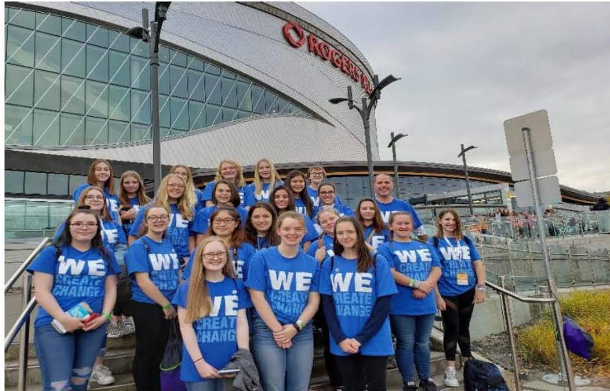
Kate Andrews “We Create Change” students outside Roger’s Place in Edmonton