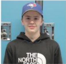
Ajay Coutts Carpentry

"I like Skills Canada because even though it is a highly stressful environment and a competition you still work together."