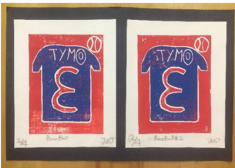
BASEBALL #2