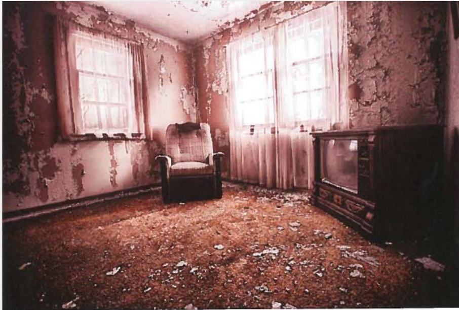
Waiting...for Something Decent on TV , n.d, by Janice Kretzer Prysunka

This exhibition consists of a selection of 18 works by 18 Peace Region artists from the larger exhibition featured at the Art Gallery of Grand Prairie in the spring of 2014. The Art of the Peace juried exhibition, called "Home Is Where The Art Is" was 100 days of art celebrating Grande Prairie's centennial.