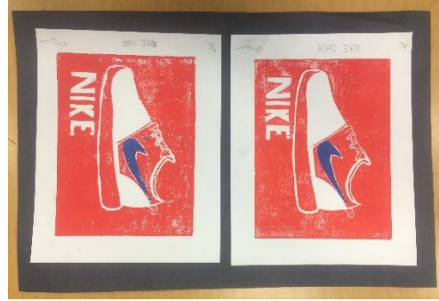
NIKE SHOE