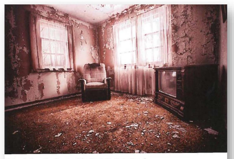
Waiting...for Something Decent on TV, n.d, by Janice Kretzer Prysunka

This exhibition consists of a selection of 18 works by 18 Peace Region artists from the larger exhibition featured at the Art Gallery of Grand Prairie in the spring of 2014. The Art of the Peace juried exhibition, called "Home Is Where The Art Is" was 100 days of art celebrating Grande Prairie's centennial.